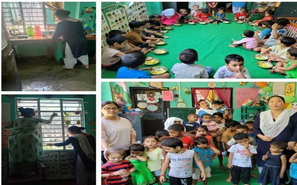
Anganwadi Workers and Anganwadi Helpers seen cleaning the centre