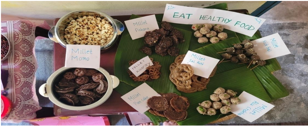
Various recipes formed from Millets