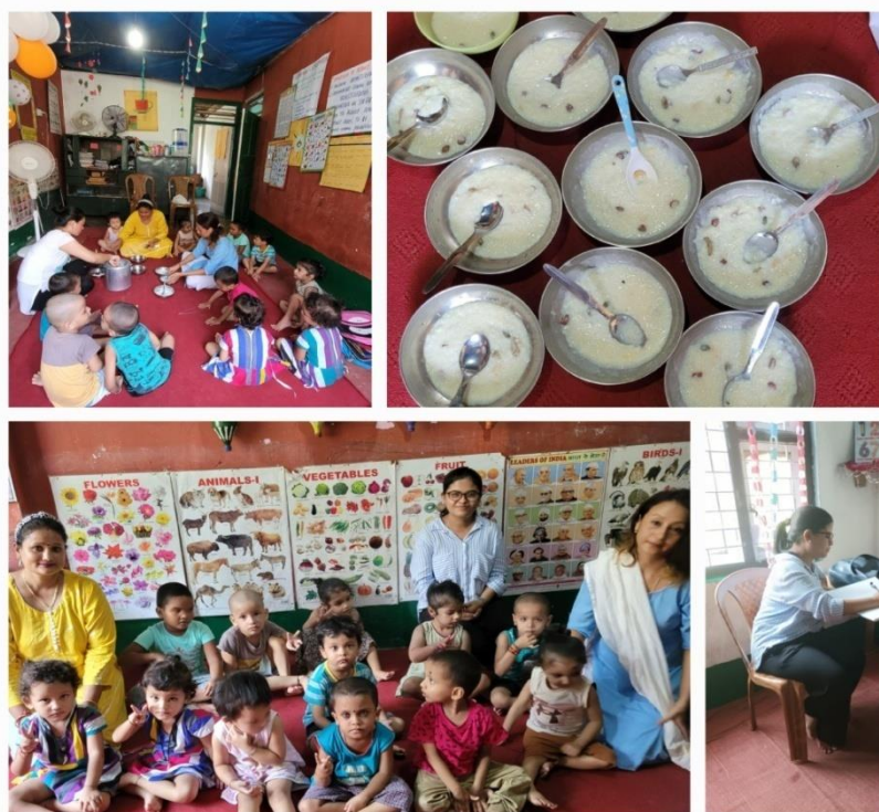
Dry Fruits with Kheer being served to the children on Thursdays